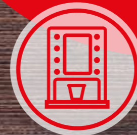
Machine Provision and Financing

Our Service Support is designed with your needs in mind. A dedicated team of experts will provide technical and commercial support: