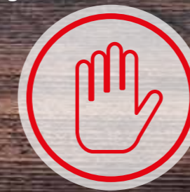
Machine Preventative Maintenance