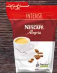
NESCAFÉ® Alegria Intense 100% Robusta freeze dried coffee

A range of NESTLÉ® and NESCAFÉ® products to create consistently delicious specialty beverages.