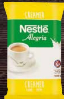
NESTLÉ® Alegria Creamer Rich and creamy smooth taste in every cup