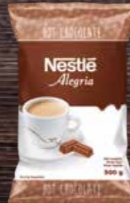
NESTLÉ® Alegria Hot Chocolate A cocoa powder with a sweet and smooth character