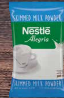
NESTLÉ® Alegria Skimmed Milk Powder All the goodness of fresh milk in a powder form