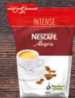
NESCAFÉ® Alegria Intense 100% Robusta freeze dried coffee