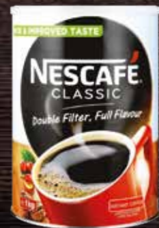
NESCAFÉ® Classic Double filter, full flavour

A range of NESTLÉ® and NESCAFÉ® products to create consistently delicious specialty beverages.