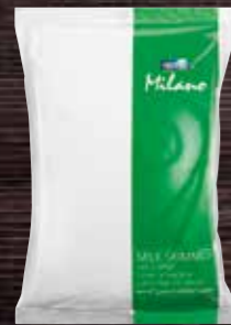
NESTLÉ® Milano Skimmed Milk Powder All the goodness of fresh milk in a powder form