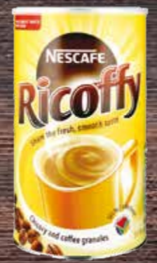
NESCAFÉ® Ricoffy Share the fresh, smooth taste - a truly South African brand since 1952

A range of NESTLÉ® and NESCAFÉ® products to create consistently delicious specialty beverages.