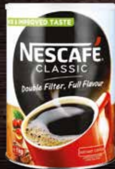
NESCAFÉ® Classic Double filter, full flavour

A range of NESTLÉ® and NESCAFÉ® products to create consistently delicious specialty beverages.