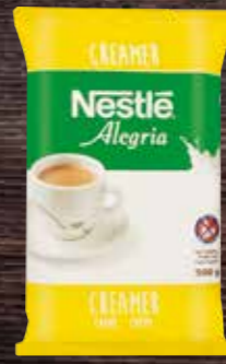
NESTLÉ® Alegria Creamer Rich and creamy smooth taste in every cup