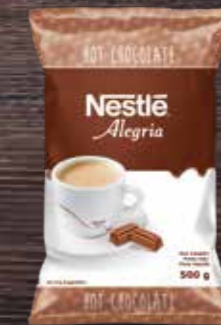
NESTLÉ® Alegria Hot Chocolate A cocoa powder with a sweet and smooth character