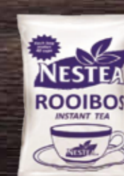
NESTEA® Rooibos Instant black Rooibos tea