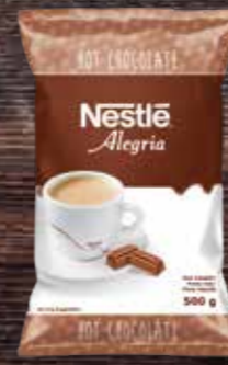
NESTLÉ® Alegria Hot Chocolate A cocoa powder with a sweet and smooth character