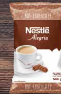
NESTLÉ® Alegria Hot Chocolate A cocoa powder with a sweet and smooth character