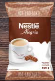
NESTLÉ® Alegria Hot Chocolate A cocoa powder with a sweet and smooth character