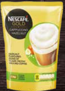
NESCAFÉ® GOLD Hazelnut Hazelnut flavoured cappuccino