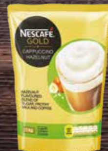
NESCAFÉ® GOLD Hazelnut Hazelnut flavoured cappuccino