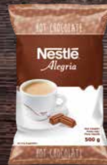
NESTLÉ® Alegria Hot Chocolate A cocoa powder with a sweet and smooth character