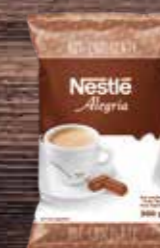
NESTLÉ® Alegria Hot Chocolate A cocoa powder with a sweet and smooth character