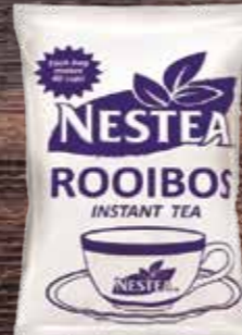
NESTEA® Rooibos Instant black Rooibos tea