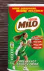
NESTLÉ® Milo Malt energy drink