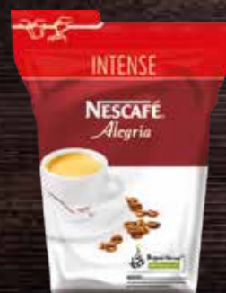
NESCAFÉ® Alegria Intense 100% Robusta freeze dried coffee

A range of NESTLÉ® and NESCAFÉ® products to create consistently delicious specialty beverages.