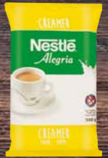
NESTLÉ® Alegria Creamer Rich and creamy smooth taste in every cup