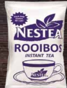
NESTEA® Rooibos Instant black Rooibos tea