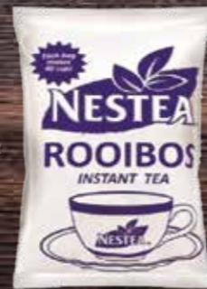
NESTEA® Rooibos Instant black Rooibos tea