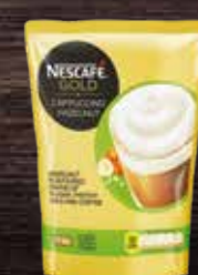
NESCAFÉ® GOLD Hazelnut Hazelnut flavoured cappuccino