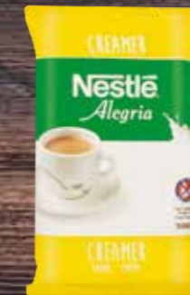
NESTLÉ® Alegria Creamer Rich and creamy smooth taste in every cup