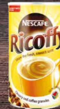
NESCAFÉ® Ricoffy Share the fresh, smooth taste - a truly South African brand since 1952