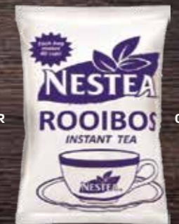
NESTEA® Rooibos Instant black Rooibos tea