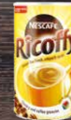
NESCAFÉ® Ricoffy Share the fresh, smooth taste - a truly South African brand since 1952