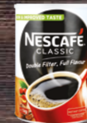
NESCAFÉ® Classic Double filter, full flavour