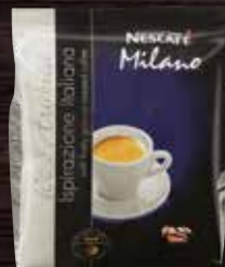
NESCAFÉ Milano® Espresso Roast 100% Arabica freeze dried coffee with micro grind

A range of NESTLÉ® and NESCAFÉ® products to create consistently delicious specialty beverages.