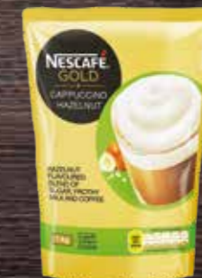
NESCAFÉ® GOLD Hazelnut Hazelnut flavoured cappuccino