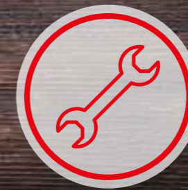
Machine Corrective Maintenance