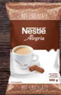
NESTLÉ® Alegria Hot Chocolate A cocoa powder with a sweet and smooth character