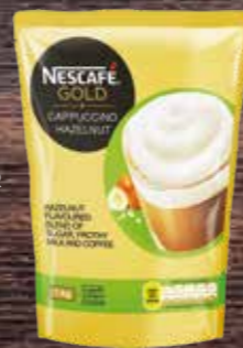
NESCAFÉ® GOLD Hazelnut Hazelnut flavoured cappuccino