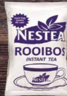
NESTEA® Rooibos Instant black Rooibos tea