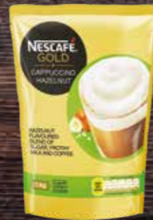
NESCAFÉ® GOLD Hazelnut Hazelnut flavoured cappuccino