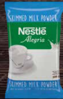
NESTLÉ® Alegria Skimmed Milk Powder All the goodness of fresh milk in a powder form