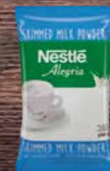
NESTLÉ® Alegria Skimmed Milk Powder All the goodness of fresh milk in a powder form