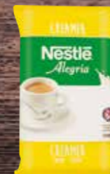
NESTLÉ® Alegria Creamer Rich and creamy smooth taste in every cup